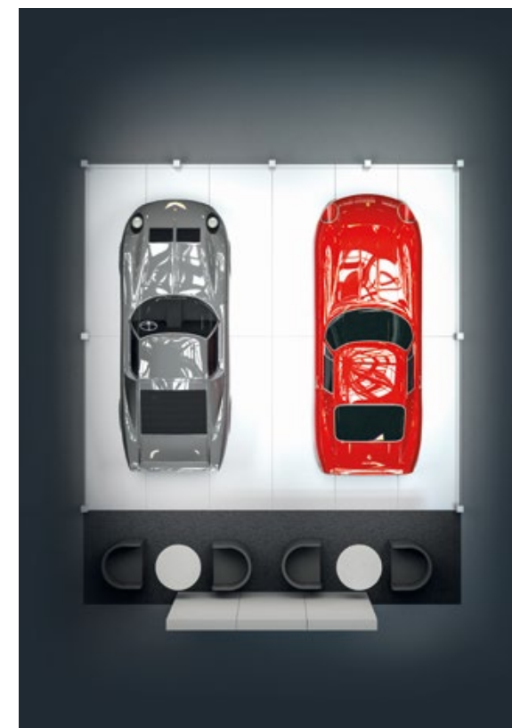
Floor plan overview

*) Not available for the Auto Zürich U35