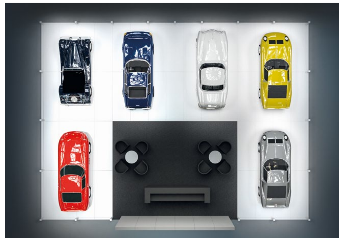
Floor plan overview

*) Not available for the Auto Zürich U35