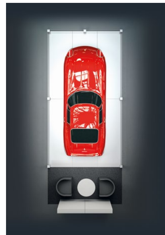
Floor plan overview

*) Not available for the Auto Zürich U35