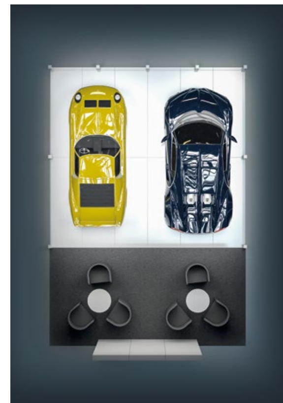
Floor plan overview

*) Not available for the Auto Zürich U35