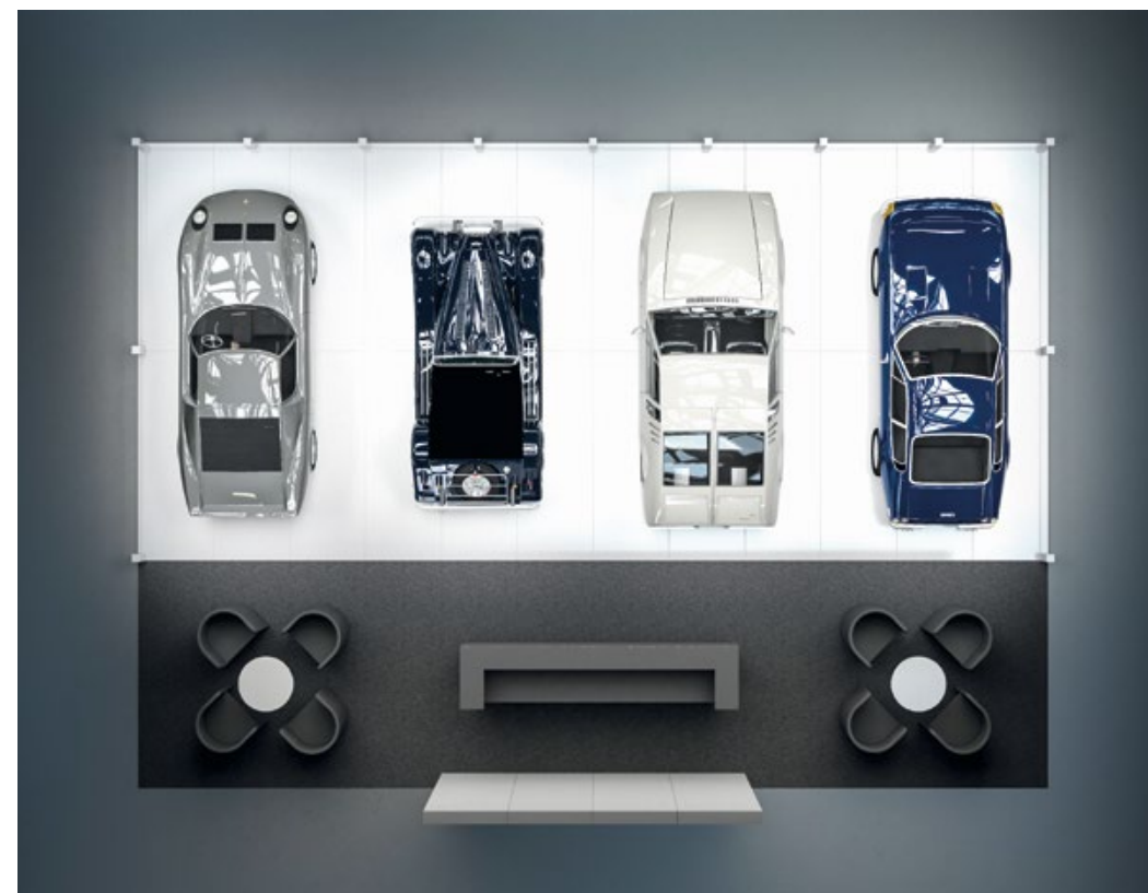
Floor plan overview

*) Not available for the Auto Zürich U35