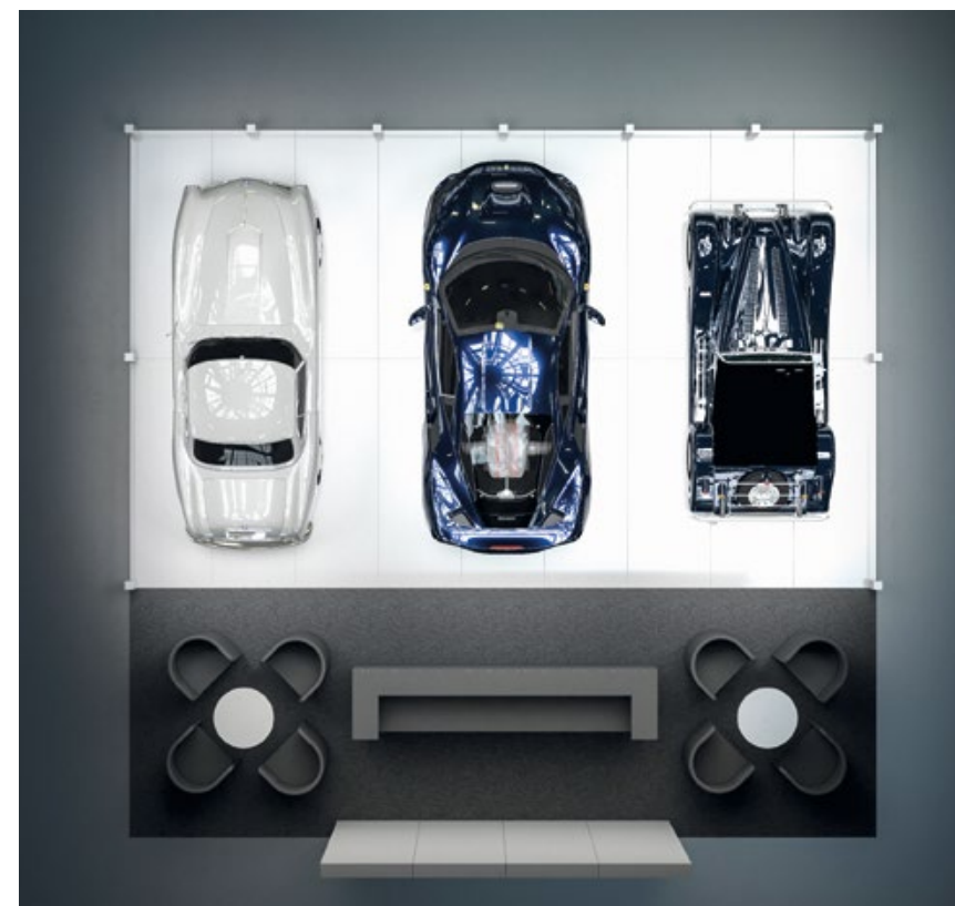
Floor plan overview

*) Not available for the Auto Zürich U35